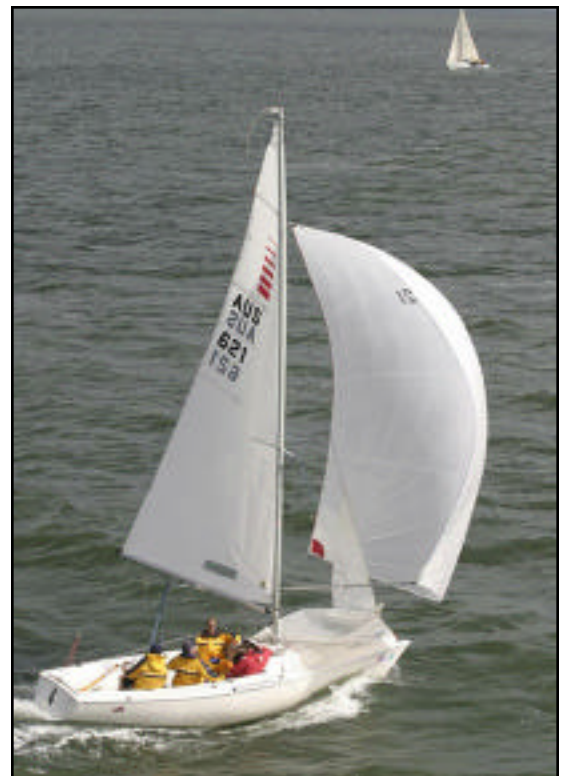
Sonar Class Pre-Olympic Regatta USA, 2004